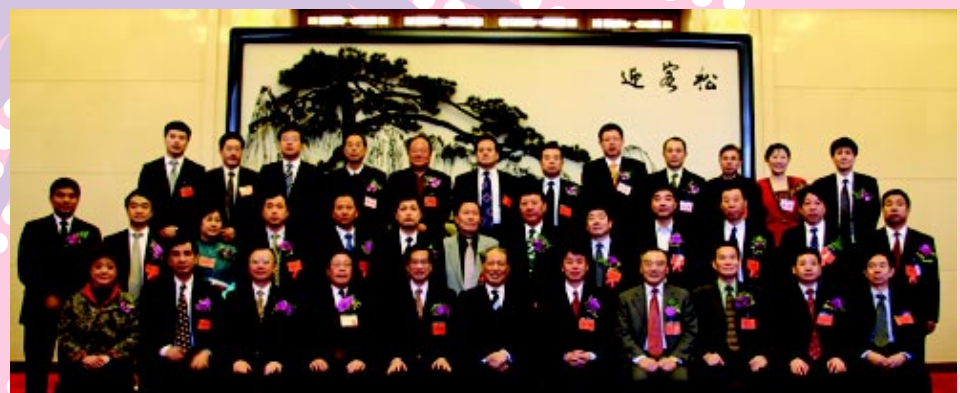
A series of activities were held in Beijing and Hong Kong to provide awardees with opportunities to exchange entrepreneurial experiences.