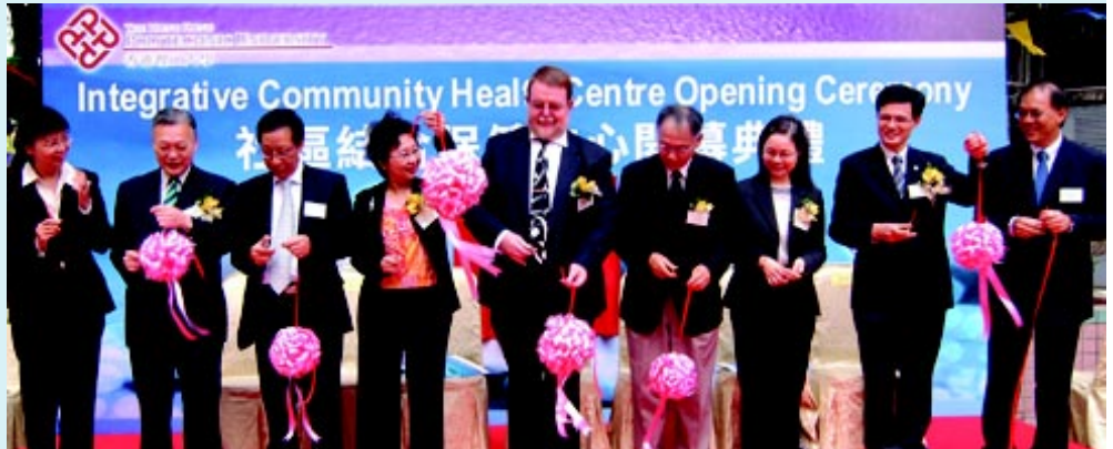
Opening of the Centre on 8 November

After a pilot run for two years, the Centre, staffed with a team of health care professionals, is now offering a wide range of one-stop services. These include self-administered health assessment, primary eye care, consultation, integrative weight