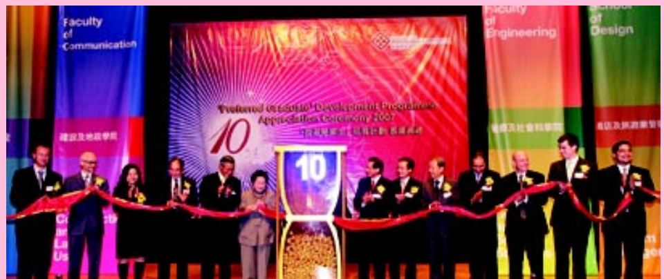
Lighting Ceremony in celebration of the Programme's 10th anniversary.

Launched in 1997, PGDP is a vastly popular student placement programme which equips students with workplace exposure and knowledge to prepare them to become ready-to-work graduates. Participants can not only apply classroom