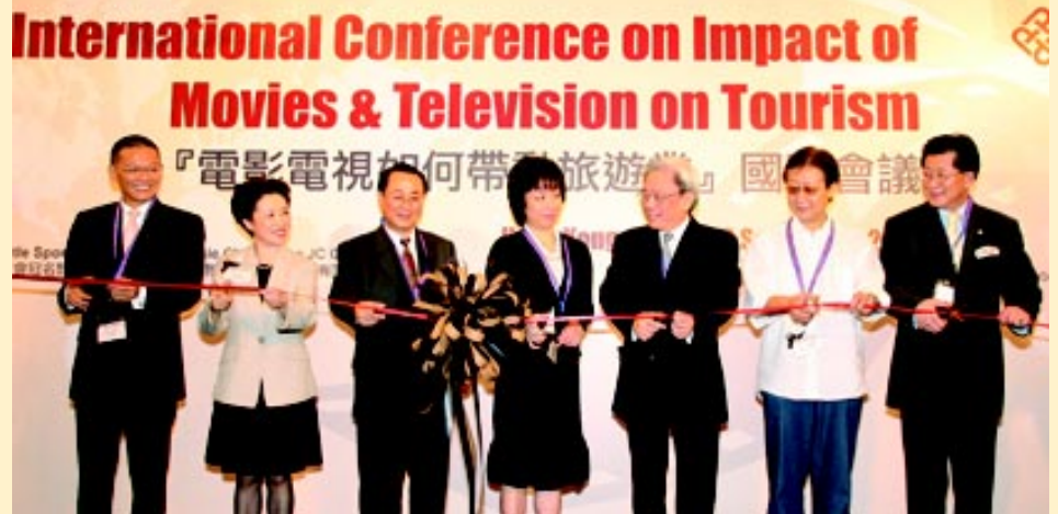
The Conference opens with a ribbon-cutting ceremony.

together more than 40 scholars, researchers, policy makers and industry professionals from different parts of the world to exchange views on how movies and television can help boost tourism and to consolidate the research efforts and industry