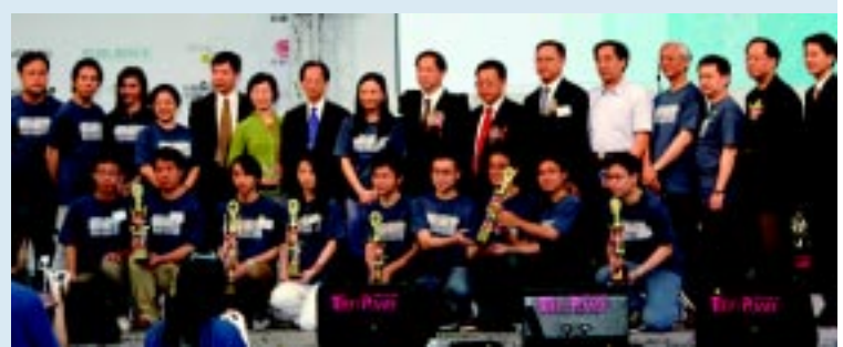
Students won plaudits from the judges for their projects named “iJADE Reporter” and “Syntactic and Semantic Proofreading for Chinese”.

A flagship project of the Junior Committee of Internet Professionals Association (iProA), IiTEC first started in 2003 with an aim to award excellent IT projects developed by young people of local colleges.