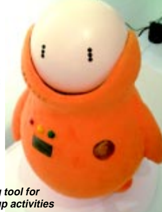
A storytelling tool for children group activities