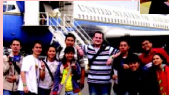
Sponsored by HSBC, winning students from Asia flew to the US for a week's tailor-made programme, enabling them to exchange ideas on leadership and business.

With their innovative business idea entitled M.I.D – Mobile Phone Identity – designed for easy membership recognition, the Hong Kong team successfully beat other winning teams from Malaysia, the Philippines and Thailand at the regional competition held in the US in June.