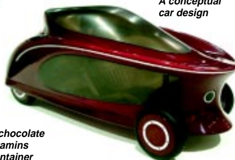
A conceptual car design