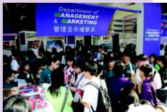
Prospective applicants are given first hand information on the PolyU programmes.