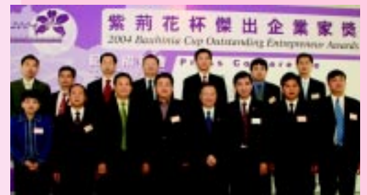
Special activities were held in Beijing and Hong Kong to provide awardees opportunities to exchange experiences and explore business opportunities with entrepreneurs in Hong Kong and the mainland.