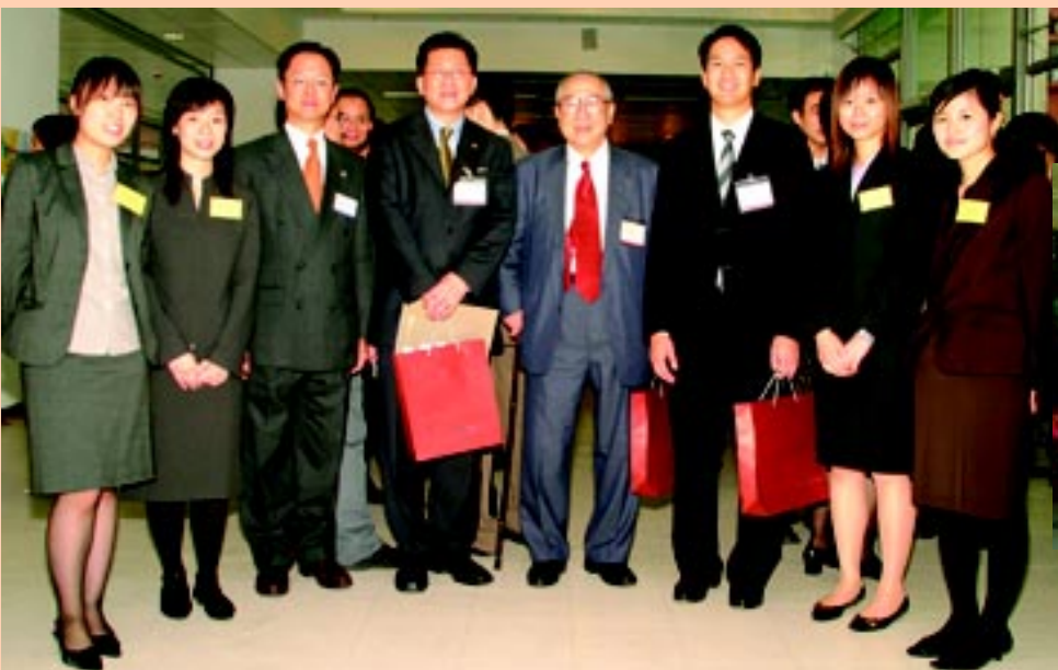
Students of the School of Hotel and Tourism Management thank donors and teachers for their support and guidance.

In addition, with the enthusiastic support from our friends and partners, the University has also accumulated a donation sum of $15 million for its Student Development Fund since its establishment in 2002. The Fund is used on activities or campaigns that can help further our students' ability and personal development.