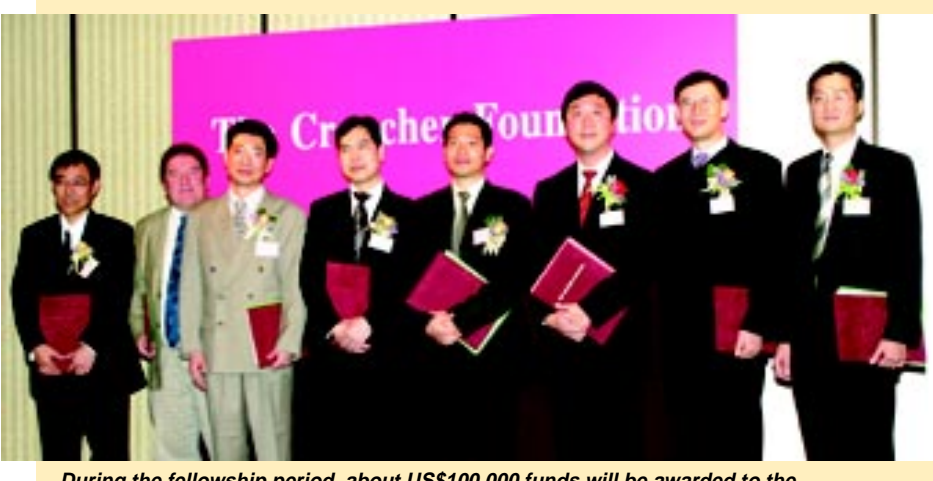
During the fellowship period, about US$100,000 funds will be awarded to the respective institution for recruiting an academic to relieve the fellow from teaching tasks and allow him to devote more time to research work.

Being the first researcher to apply the unique feature of a