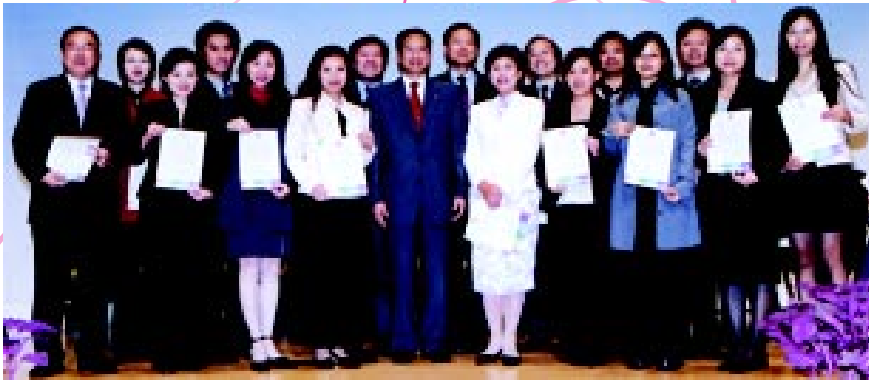
The President also presents Certificates of Appreciation to the working team whom together has made the record-breaking Human Rainbow a success.

In the “President’s Awards for Excellent Performance/ Achievement 2002/03”, the University paid tribute to staff members who have made outstanding performance and contributions to the University and the community.