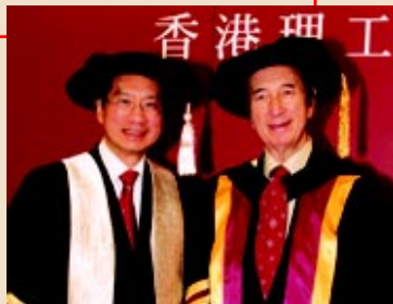
Known for his support for charities and education undertakings, Dr Stanley Ho has recently donated $10 million to PolyU.