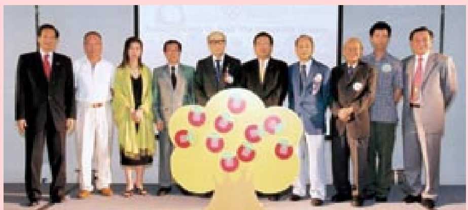
A tree naming ceremony was held last July in appreciation of the support received from PolyU alumni and sponsors.