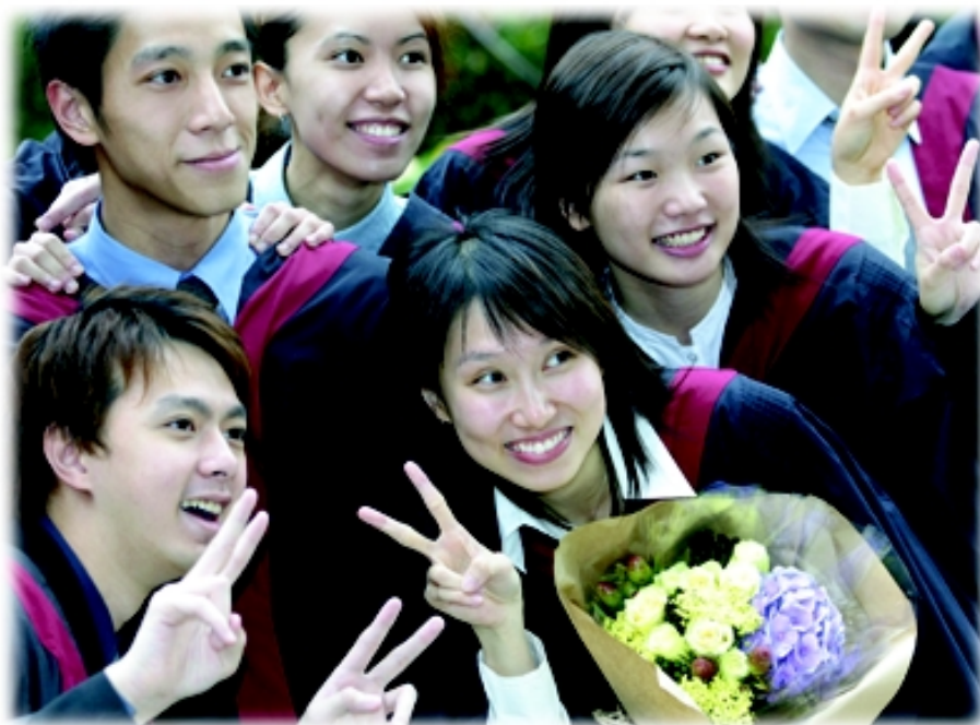
Top five degree programmes with the highest employment rate

In an independent survey released earlier by the Website Education18.com, the perceived working values of PolyU graduates have increased significantly in the eyes of the employers. A total of 192 employers were interviewed. Among the eight UGC-funded institutions, PolyU was ranked the third after HKU and CUHK. For details of the survey, see www.education18.com . ❖