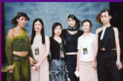
Award-winning students of the Master of Arts programme in Fashion and Textile Design.