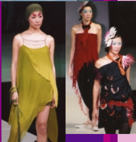
Winners from the degree and higher diploma programmes.