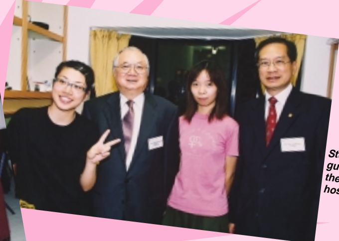
Students tour guests around the newly built hostel.