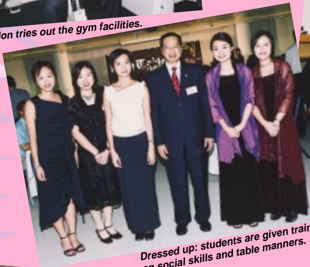
Dressed up: students are given training on social skills and table manners.