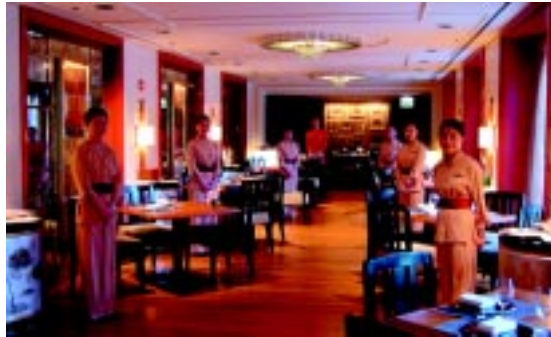
Five HTM students share their fruitful experience from The Peninsula Chicago.

Under the tutelage of the restaurant manager, the students learned how to complement meals with the right wines and mix popular alcoholic drinks. They observed how the Chinese fusion dishes were prepared under the good hands of the top