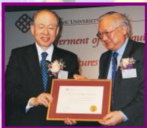
Prof. Noyori (above) and Prof. Sharpless (photo on right) receive their certificates of appointment from Sir Gordon.

As co-recipients of the 2001 Nobel Prize in Chemistry, Prof. Noyori and Dr Knowles were laureated for their work on chirally catalysed hydrogenation reactions and Prof. Sharpless for his work on chirally catalysed oxidation reactions. ❖