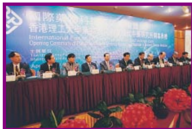
The forum on pharmaceutical technology opens.

The Institute of Materia Medica and the Institute of Modern Chinese Medicine form two units of the PolyU Shenzhen Research Institute, a conglomeration of research centres and training facilities. The other three units of the Research Institute are, namely, the China Accounting and Finance Research Centre, Hong Kong Young Industrialists Council Executive Training Centre, and the MIC Multimedia Technologies Ltd.