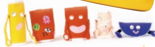
"DIY Zipper Dolls" by Wong Siu-long