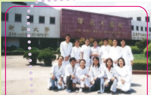
Sir Run Run Shaw Hospital in Hangzhou offers placements for 11 PolyU students.