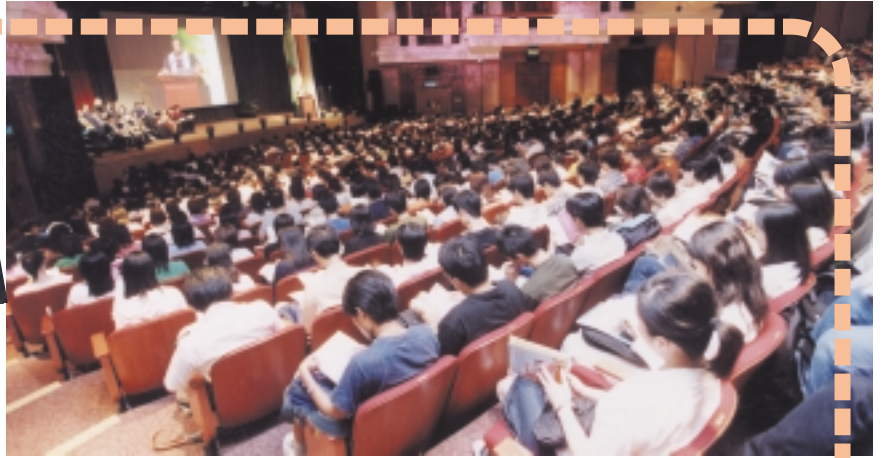
Welcoming ceremony: New students packed the Jockey Club Auditorium