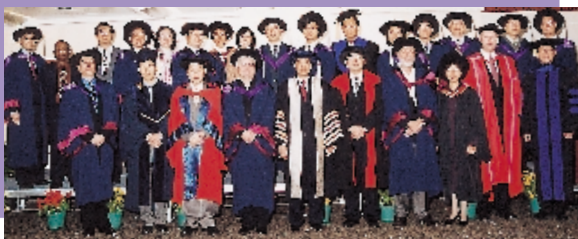
The DBA programme sent forth 16 graduates at its Third Graduation Reception this year, the largest number since the launch of the programme.

The Motorola sponsored programme is identical to the existing DBA programme offered by PolyU. The minimum duration for the completion the programme is three years. All participants must have a recognised MBA degree or an equivalent master's degree and at least eight years of managerial or professional experience.