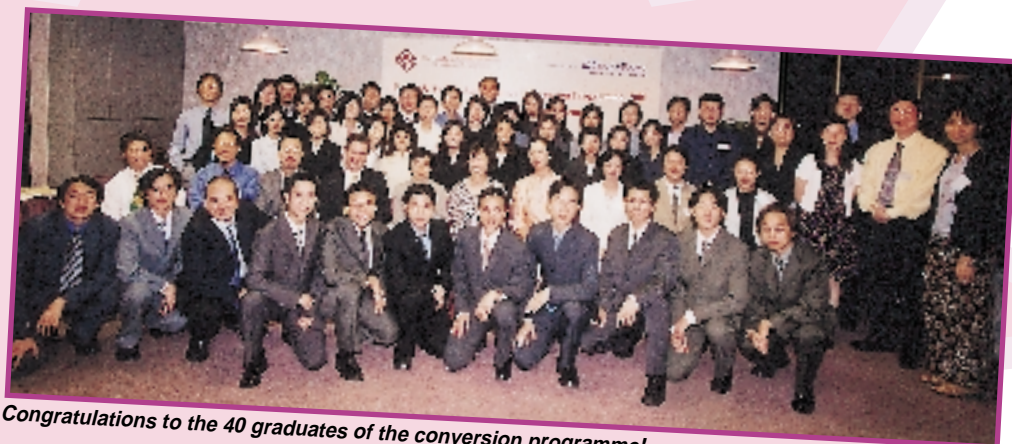
Congratulations to the 40 graduates of the conversion programme!