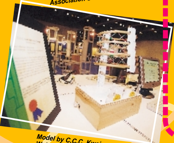
Model by C.C.C. Kwei Wah Shan College.