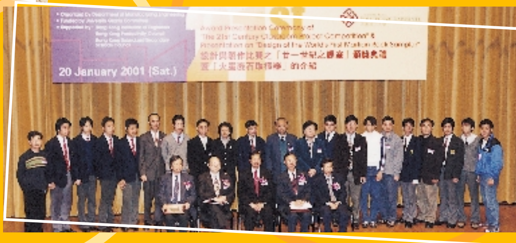
Winners pictured with officiating guests at the award presentation ceremony.