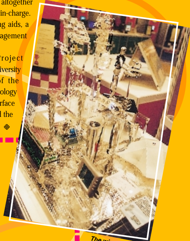
The winning project.