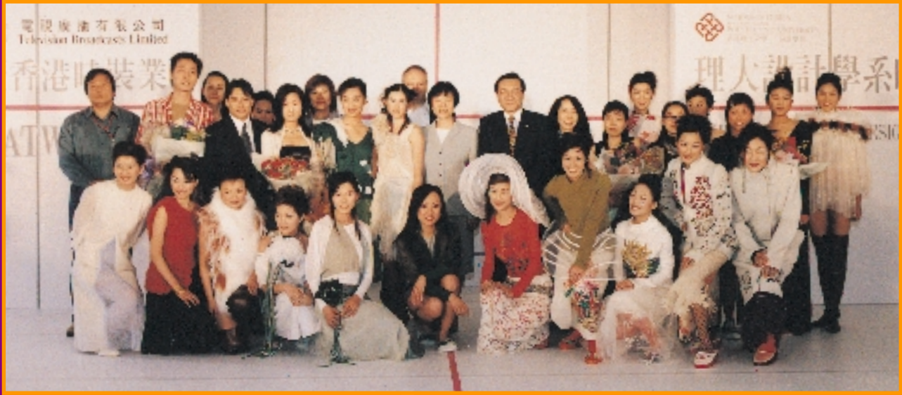
Models and guests-of-honour pictured at the end of the show.