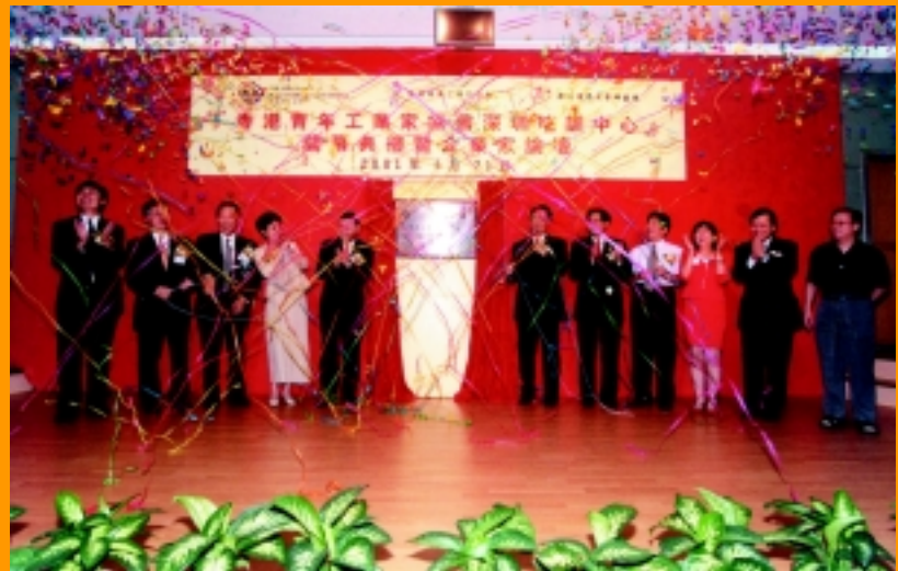
Celebrating the opening of the new outpost in Shenzhen.