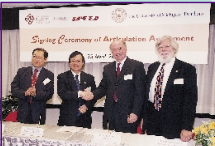
Signing of an articulation agreement with The University of Michigan-Dearborn on campus.