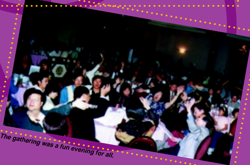
The gathering was a fun evening for all.