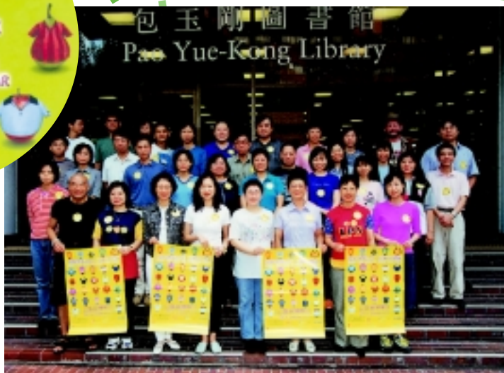
The Library, once again, has the largest number of participants and raised the highest amount of donation.

T o show our concern for the needy and to contribute towards local charities, the University again participated in "Dress Casual Day" organised by the Community Chest on 28 September 2000.