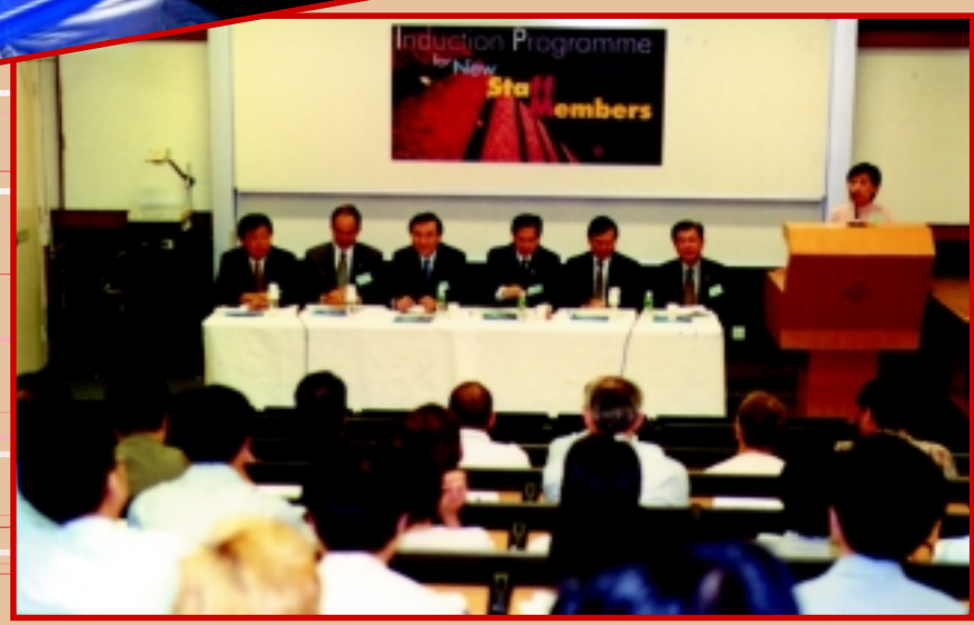
Senior Management greets the newcomers.