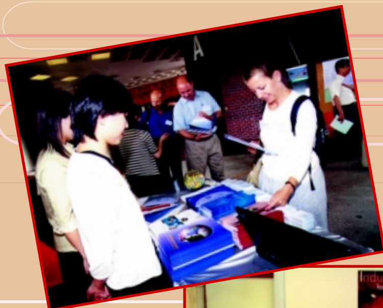
Newly joined staff browse at printed materials which outline the services provided by administrative or self-financed offices.