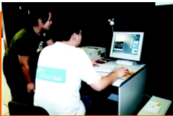
A staff member of Institute of Textiles and Clothing demonstrates how the 3-D body scanner works.

The number of credits required for graduation is 145 for the double degrees, 108 for BA(Hons) in Management, and 109 for BSc(Hons) in Computing.