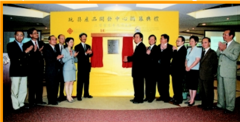
The plaque unveiling marks the opening of the Centre.