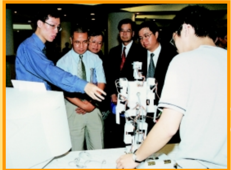
After the ceremony, the official party and participants saw a demonstration of an interactive toy development concept.

feature prominent overseas and local speakers who will be sharing their experience with members of the industry.