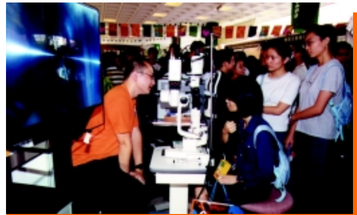
Different equipment displayed at the booths for visitors to try out.

The University’s unique programmes cover those in the areas of Surveying and Geo-Informatics, Fashion