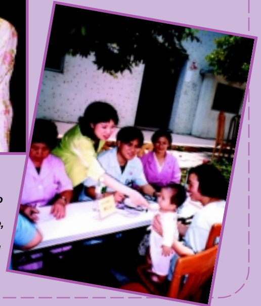
Reaching out to Guangzhou: To promote health for pregnant women in Guangdong Province, the department staged a Safe Motherhood Awareness-raising Campaign in May in both Hong Kong and Guangzhou.