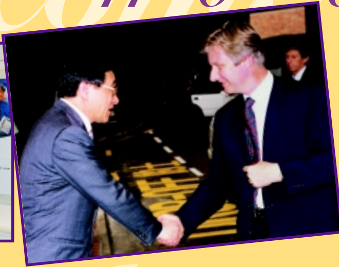
Left: The Deputy President extends a warm welcome to Prince Philippe.