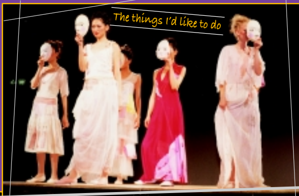
The things I'd like to do