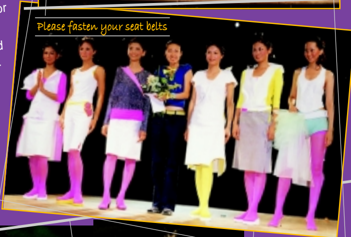
Please fasten your seat belts