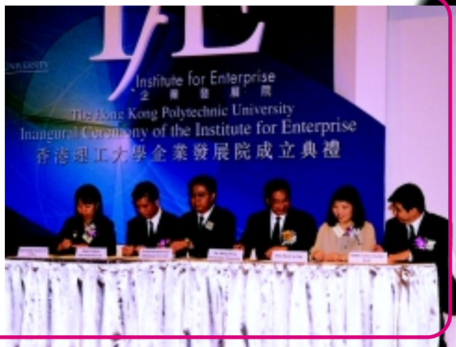
Signing of partnership agreements.