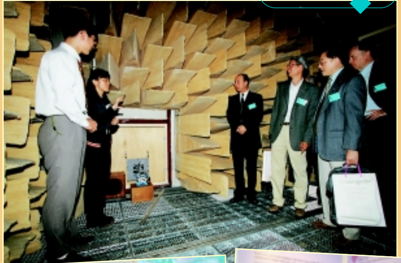
Showing off the research work conducted at the acoustic laboratory of the Department of Mechanical Engineering.