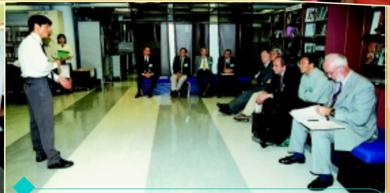
Briefing for RGC members at the Fashion and Textile Resource Centre.