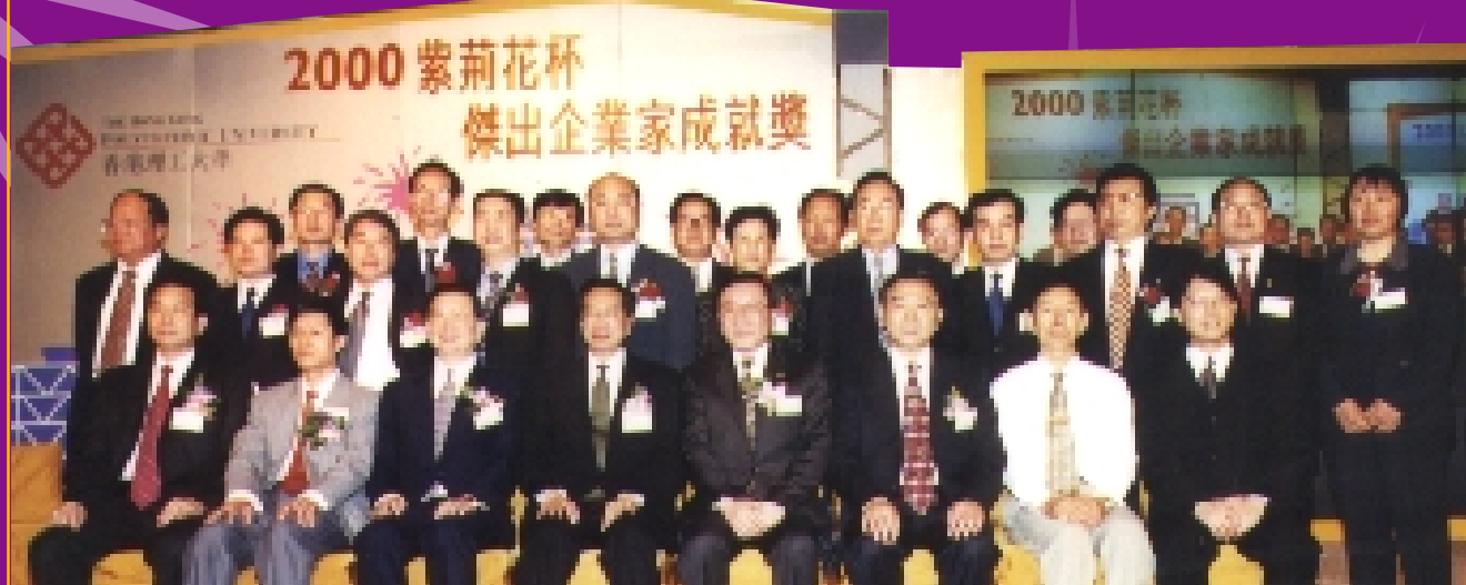
The awardees, guests and PolyU officers posing together.